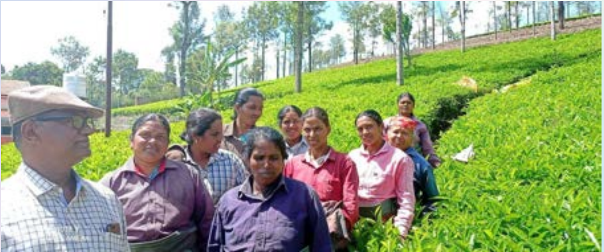
Our companions who provide us with the means of our livelihood, fighting adverse weather condition often. Thanks to their solicitude with us.