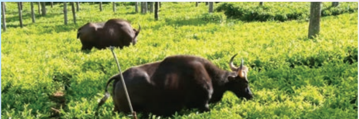
Our natural friends, the Bisons, keeping company with us grazing in our tea gardens- a common sight these days