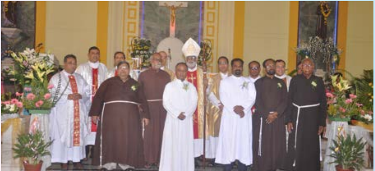
Golden & Silver Jubilarians with Bishop and Superior General

I wish to thank all the relatives, friends and well-wishers of our Jubilarians A big thank you for being here, for sending us your brother to be our brother, and for coming over to join in their joy and celebration of life.