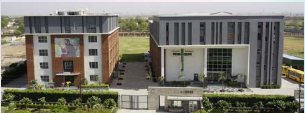
ST. FRANCIS SCHOOL, GREATER NOIDA, UP

As a Franciscan Religious Brother, it is good to ask myself: How do I think and act in my daily activities? Do I think before I act? Is there a difference (positive growth) in my thinking pattern as I gain experience in this way of life? If so, in which direction I am moving? Let every attractive advertisement that I read and watch in the print and electronic media respectively help me to think differently (unlike that of Eve) using the mind of Jesus whom I promised to follow radically. "The attitude you should have is the one that Christ Jesus had..."(Phil 2:5) Have this mind among yourselves, which is yours in Christ Jesus.