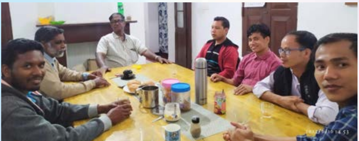
Energizing after a hard day's work with a fresh cup of tea, at Mt. Alverna, Kotagiri.

Thankfully yours in the Lord: Compiled by Brothers