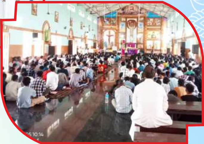
Brothers attended Vocation Camp at Kalunga, Rourkela Diocese