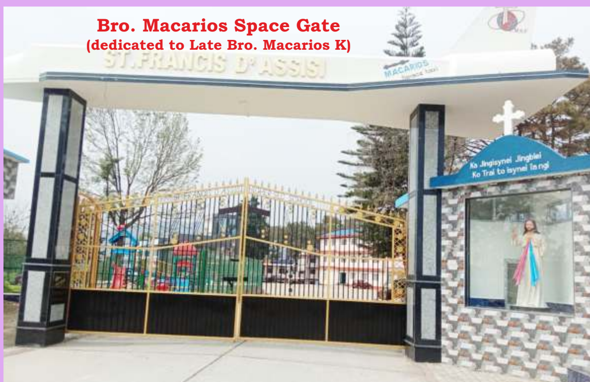
Bro. Macarios Space Gate (dedicated to Late Bro. Macarios K)