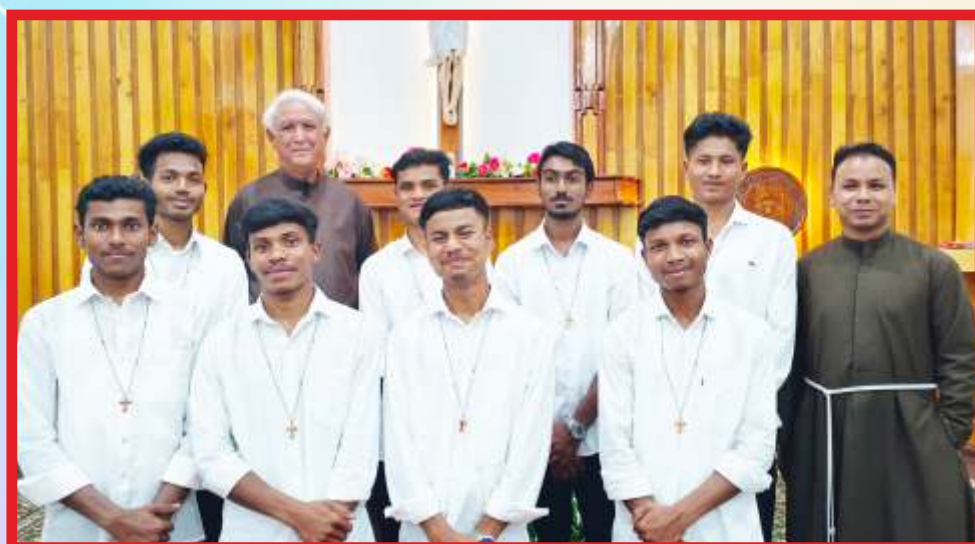
First year Novices