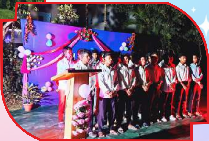
Candidates at Bongaigaon, Assam