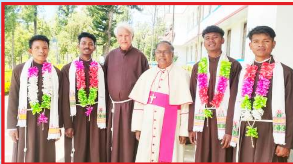
Newly professed Brothers with Bishop